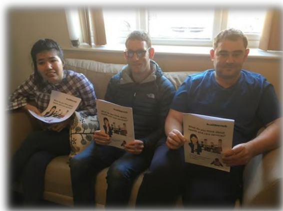
Service users at Creative Support taking part in the NHS Long term plan survey

The survey was also shared with teachers at a local secondary school, and two local colleges to gain the views of younger people.