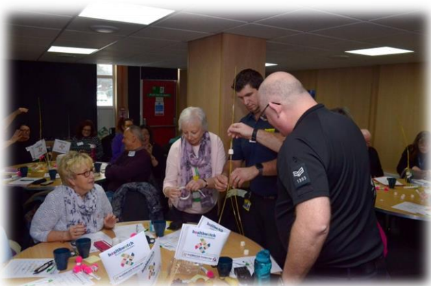
Partners getting involved in the event activities

Participants were also given the opportunity to contribute to the upcoming priorities of the service by providing their views on what needs to improve locally. Feedback from the event was generally positive, with many of the participants keen to be involved in the future work of Healthwatch.